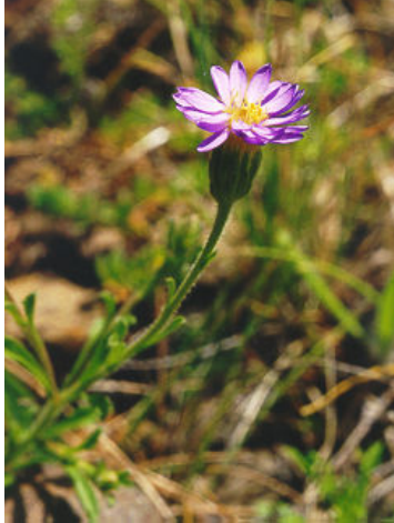
Vittadinia cuneata var. cuneata . H&A Wapstra.