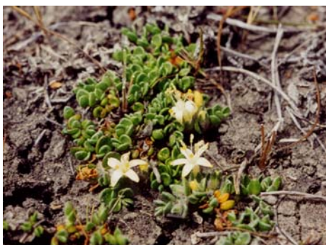
Wilsonia rotundifolia . H&A Wapstra.