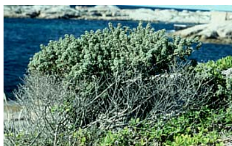
Zieria littoralis.