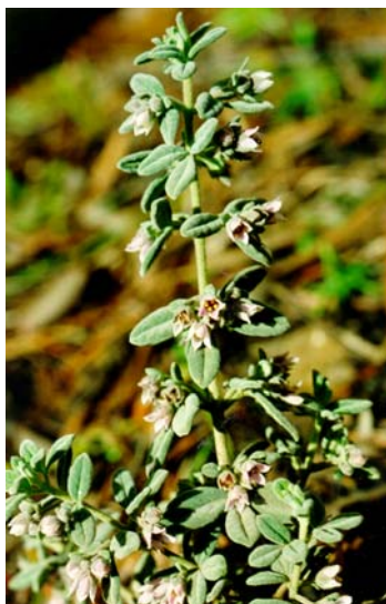
Zieria littoralis . H&A Wapstra.