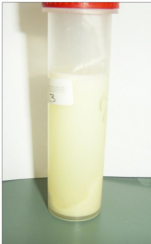
Milk sample affected by mycoplasma mastitis

A Polymerase Chain Reaction (PCR) test is now available for milk samples. The evidence so far is that this PCR test is as reliable as the culture test. The PCR tests for the presence of DNA consistent with M. bovis but does not demonstrate the presence of live M. bovis in the milk. Importantly, the PCR test is still reliable even if the sample contains antibiotics or other infections.