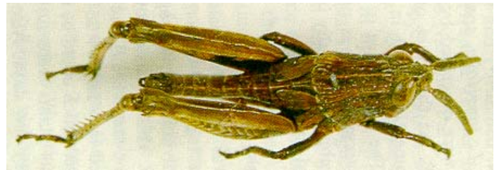
Figure 2. Schayera baiulus .